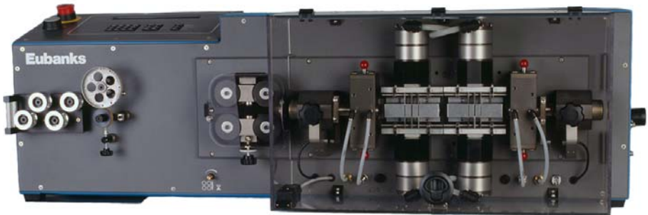
SHOWN WITH OPTIONAL 2 OTT MODIFICATION KIT

The 4040 is as powerful as the 2940 and is the most flexible of the air strippers. Equipped with very powerful tandem-cutterheads that are controlled independently, allows you to strip up to 100” on the leading end and 4” on the trailing end. The 4040 is ideal for processing power cords and will also process automotive battery cables or welding cable. Equipped with the standard tooling, the 4040 can cut and strip single stranded conduct wires ranging from 10 to 2 AWG, with a maximum O.D. of .480” (12mm). With optional tooling and modification kits, the 4040 can process wires down to 18 AWG (0.96 mm 2 ) and up to 2/0, also known as Two Ott cable with a Max Diameter of .625” (15.9mm). The 4040 can also process a wide variety of cable types such as flat multi-conductor cable, parallel conductor cables with 2, 3 or 4 conductors, coaxial cable. It can process wire lengths from 3 in. to 8,333 feet (76.2mm to 2,540m) basically a mile and a half.